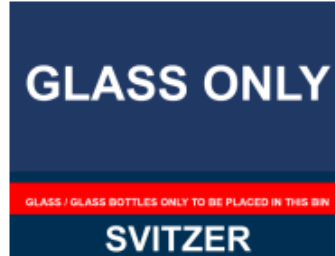
One Wheelie Bin for Glass.