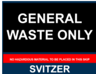
Two Skips for general, non-recyclable, non-hazardous waste.

Eight lockable skips will be labelled as illustrated below: