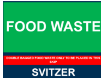
Two Skips for Food waste only. Must be double black bagged.