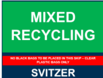
Two Skips for Paper, Cardboard, Plastic packaging. Must be in clear plastic bags.