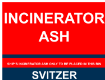
One Wheelie Bin for Ship's Incinerator Ash.

If Svitzer Leven unable to attend the vessel direct, the following Waste Streams cannot be landed into the receptacles: